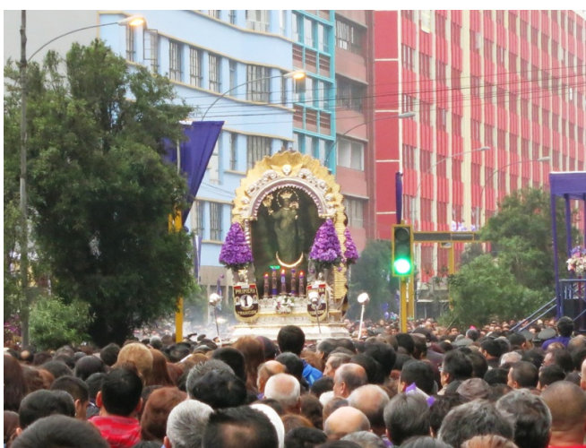
You can read more about this major Peruvian festival at this informative website, from which the above two photos are borrowed.